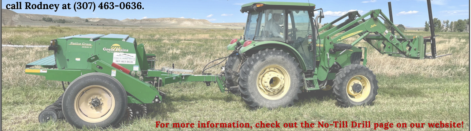
For more information, check out the No-Till Drill page on our website!

Reservations are scheduled on a first-come, first-served basis, and spring is our busiest time of year. We encourage producers to contact the office early to secure a spot on the planting schedule and avoid delays once field conditions are ready! To reserve a drill or discuss your planting plans, call Rodney at (307) 463-0636.